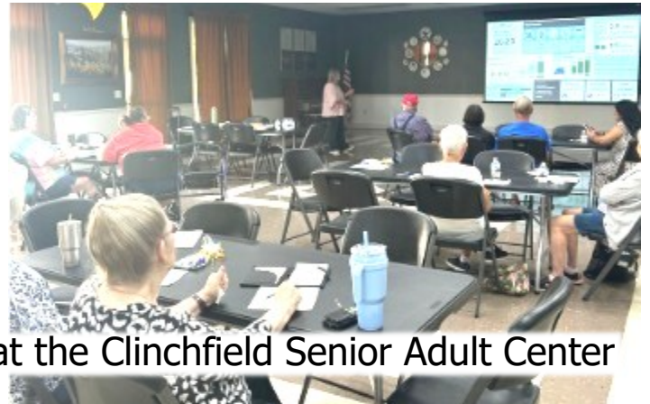
Elder Abuse and Fraud Education Class at the Clinchfield Senior Adult Center