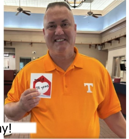
National I Love my Credit Union Day!