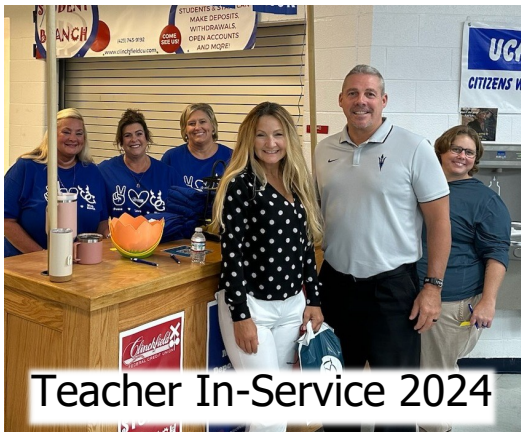
Teacher In-Service 2024