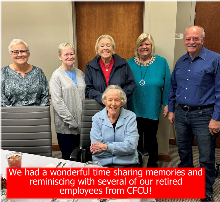
We had a wonderful time sharing memories and reminiscing with several of our retired employees from CFCU!