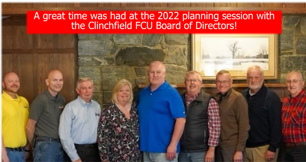
A great time was had at the 2022 planning session with the Clinchfield FCU Board of Directors!