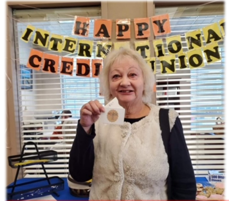
Another great International Credit Union Day took place in October. Congratulations to all the gift card winners!