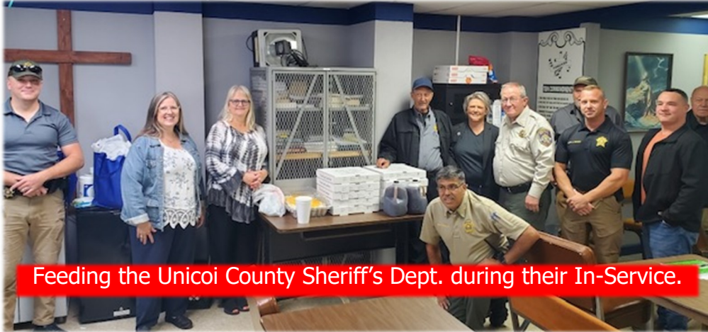
Feeding the Unicoi County Sheriff's Dept. during their In-Service.